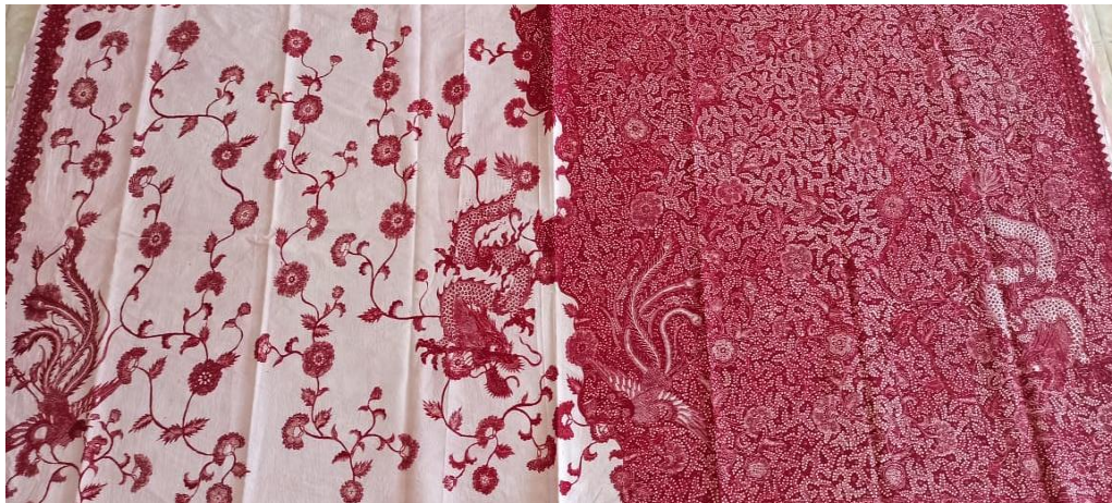
Figure 9. Implementation of the Latohan Tradition-Cultural Approach: Dragon, Hong and Latohan (Authors, 2022)

interacting with other motifs. The plant also has a history, cultural relationship and social tradition with many individuals hence, it has a deep meaning and identity.