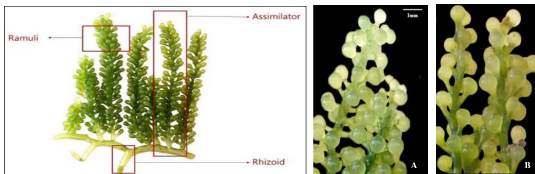
Figure 1. Latoh Plant Anatomy and Forms of Caulerpa lentillifera (A) & Caulerpa racemosa (B) (Estrada, 2020)

According to Syamsurijal (2015) on the website of the Ministry of Maritime Affairs and Fisheries of the Republic of Indonesia, Latoh is a type of seaweed that lives attached to the bottom of shallow waters. This was supported by interviews with people in Lasem who revealed that it is usually found attached to the edge of coral reefs on the beaches of Lasem. However, it is frequently observed growing on sandy bottoms in the intertidal zone. Latoh can be found in coral reefs with a depth of up to 200 meters. The plant lives attached to the bottom substrate of marine waters, such as dead coral, coral fragments, sand, and mud. The growth is epiphytic or saprophytic and it is sometimes associated with other marine plants (Atmadja et al. , 1996). This shows that Latoh is a friendly plant because it can coexist without harming its host. Furthermore, it lives by obtaining nutrients from dead organic matter, which indicates that it is beneficial to the ecosystem. It can also convert these dead materials into energy, thereby recycling nutrients in the environment.