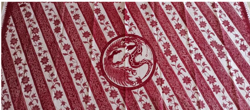
Figure 8. Implementasi Latohan Pendekatan Tradisi-Budaya: Hong Liong in Harmony (Authors, 2022)

In the center of the diagonal motif as the main elements are the Hong bird and the Dragon in a circle. Their visualization is depicted in a way, where they seems to form a Yin and Yang symbol, which is a picture of natural harmony in the philosophy of Chinese society (Dwitari, 2017). There is no good unless it is followed by bad, and there is no darkness if it is not accompanied by light, and human existence is even comprises of two sexes, male and female. The meaning of Yin-Yang dualism is also found in the Hong bird, which symbolizes the two elements of nature, namely fire and air as well as the symbol of the upper world. Meanwhile, the dragon represents the other two elements of nature, namely water, and earth as well as a symbol of the underworld. This interpretation is in line with the beliefs held by the Chinese and Javanese communities, which involve the Lasem people. To unravel the meaning of dualism, the Latohan motif is juxtaposed with Lasem's identity. This can be seen from the basic character of Latoh who brings dynamics into its environment with positive benefits and then represents the presence of a third space.