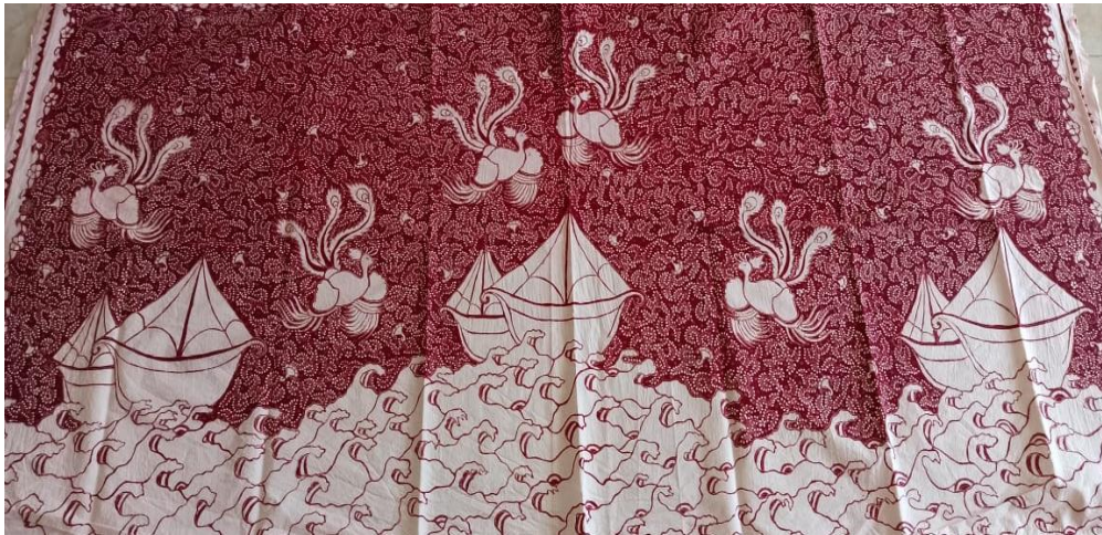
Figure 7. Implementation of the Historical and Tradition-Cultural Approach: Latohan and the Cheng-Ho Boat (Authors, 2022)

Another story on batik involving the Latohan motif can be seen in Figure 8. The art consists of diagonal lines filled with flower tendrils and Latohan strands.