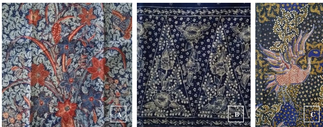
Figure 4. The Embodiment of the Third Space – Latohan Motifs in Lasem Hand Batik