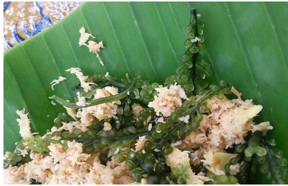
Figure 2. Lasem Traditional Food – Urap Latoh (Authors, 2018)

Based on the facts about Latoh , its elastic shape, and character can be created or described into dynamic forms to produce more varied and beautiful curves. Its beauty also becomes more meaningful when people know that it is “friendly” as well as useful. This gives Latoh plants an important role in the Lasem culture, apart from its benefit as a food source. Through the Third Space theory, Latoh is part of the perceived or first space because it has the appropriate category, namely physical. Therefore, it is a space that can be directly seen through the senses and can be observed for growth. It can also provide life through food as well as facilitate the sustainability of arts and culture, especially in Lasem. This is in line with Lefebvre (1991) that perceived space is local, and can be observed, analyzed, and occurs repeatedly. When viewed from the architectural analysis, these recurring events are related to the daily activities carried out by individuals in certain buildings or areas. Activities that occur consistently and are the same indirectly give character and habits. Meskell-Brocken (2020) makes it clear that perceived term is a process of producing material forms that are the result of daily activities and behavior, which later leads to a social-spatial perspective (Meskell-Brocken, 2020). Social space is formed when there is interaction with a wider scope. For example, involving the wider community, namely the Lasem community.