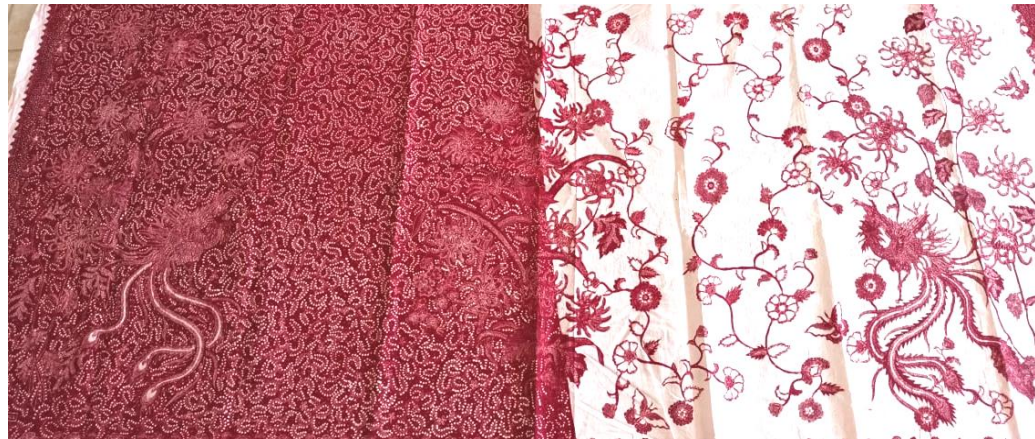
Figure 6. Implementation of the Latohan Facts and Traditions-Cultural Approach: Pagi-Sore Latohan, Krisan & Hong (Authors, 2022)

different motifs, hence, two patterns were made on one cloth. This means that one batik can be used twice and two motifs can be used in one day (Ni'mah et al. , 2021; Vina, interview 2022). The written batik in Figure 6 is called Pagi-Sore Latohan, Krisan and Hong Pagi Sore Latohan, Krisan and Fenghuang bird. The left side of the batik uses the Latohan motif, which fills the cloth as a background. The Hong bird on the left side faces the right and it is decorated with krisan flowers. Meanwhile, small krisan spreading as a background are depicted on the right side, and on the far right, there are Hong birds facing left. The Pagi and Sore sides region are separated by a bouquet of krisan flowers, which is locally called buketan krisan .